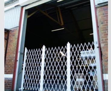
Closed Allows for ventilation whilst securing the opening.