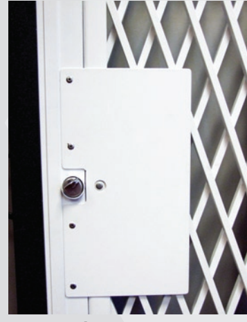
Innovative thumb-turn lock