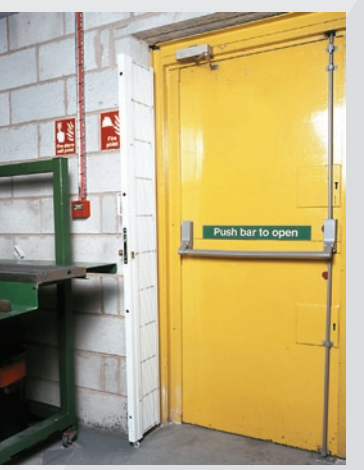
Folds away to leave opening clear